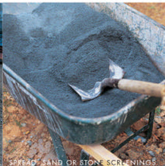
SPREAD SAND OR STONE SCREENINGS