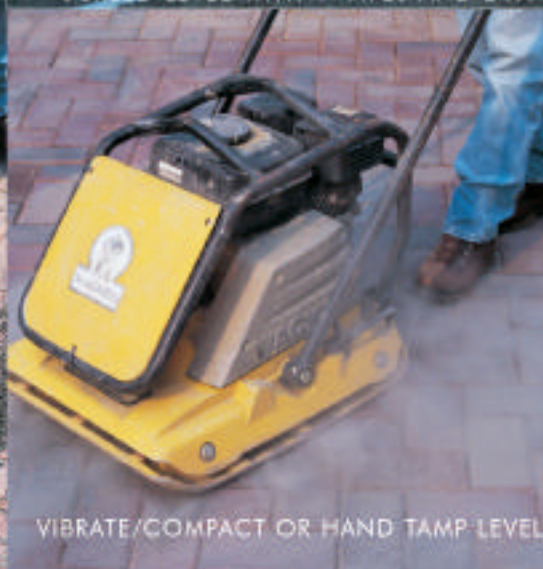
VIBRATE/COMPACT OR HAND TAMP LEVEL