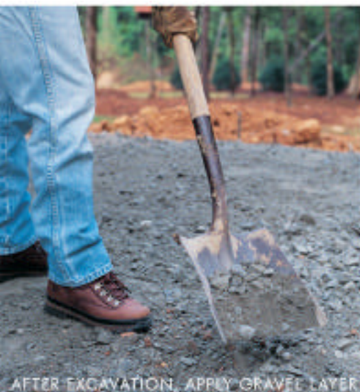
AFTER EXCAVATION, APPLY GRAVEL LAYER