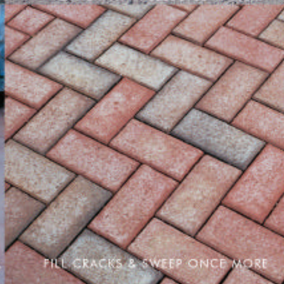
FILL CRACKS & SWEEP ONCE MORE