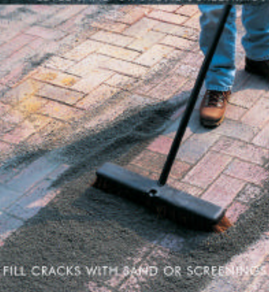
FILL CRACKS WITH SAND OR SCREENINGS