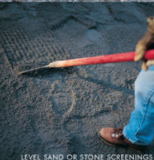
LEVEL SAND OR STONE SCREENINGS