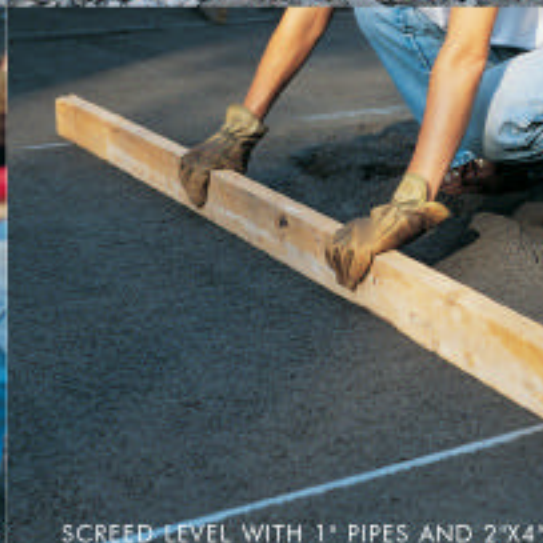
SCREED LEVEL WITH 1" PIPES AND 2"x4"